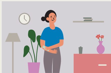
Apply insect repellent regularly.