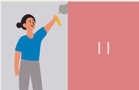
Spray insecticide in dark corners around the house.

Protect yourself and your employer's family from Dengue, especially if you are living in a dengue cluster, with the following steps: