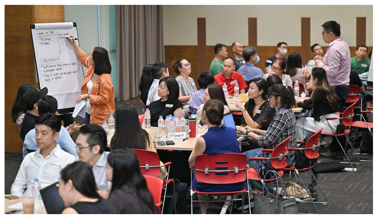
Focus group discussion with employers on 24 October 2023.