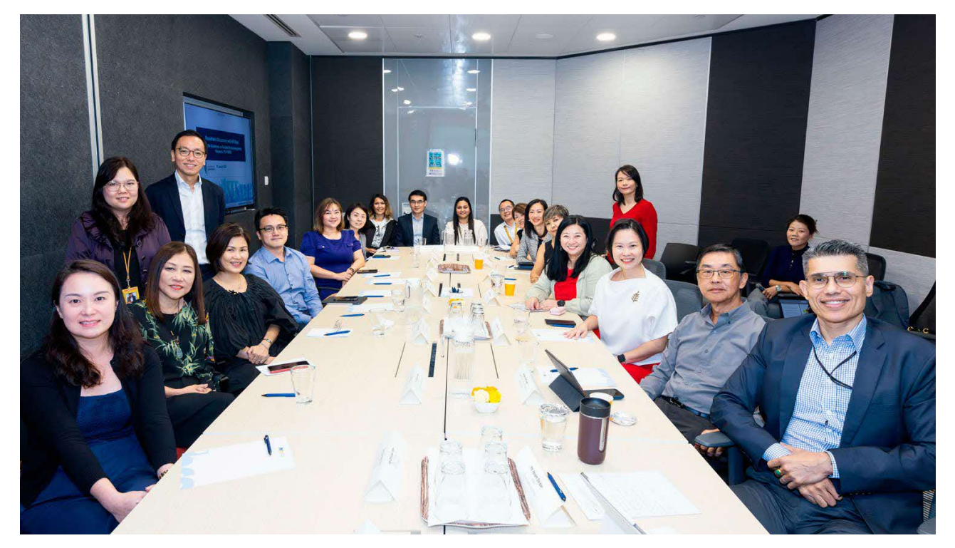
Roundtable discussion with human resource practitioners on 16 January 2024, organised by the Institute for Human Resource Professionals.