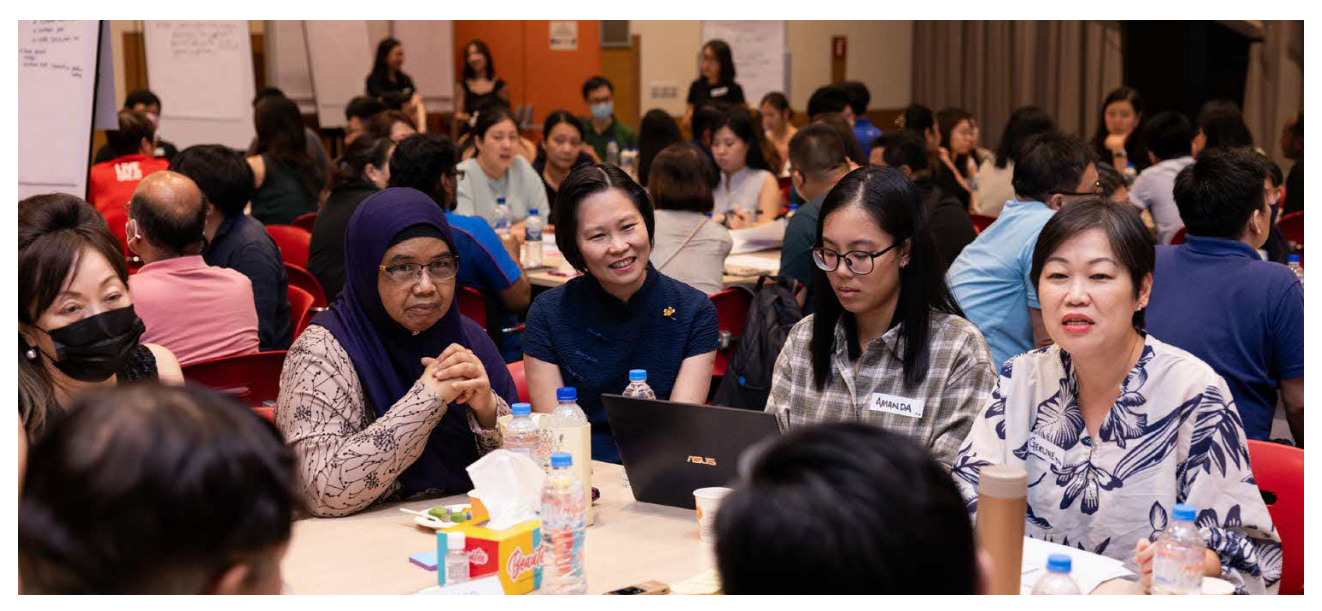
MOS Gan attending a dialogue session with employees on 11 October 2023.