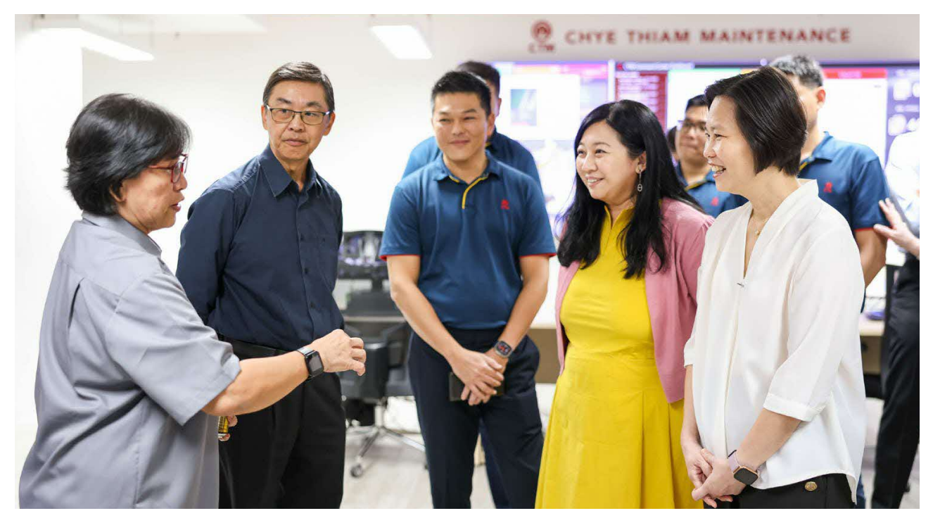
Visit to Chye Thiam Maintenance Pte Ltd on 28 November 2023.