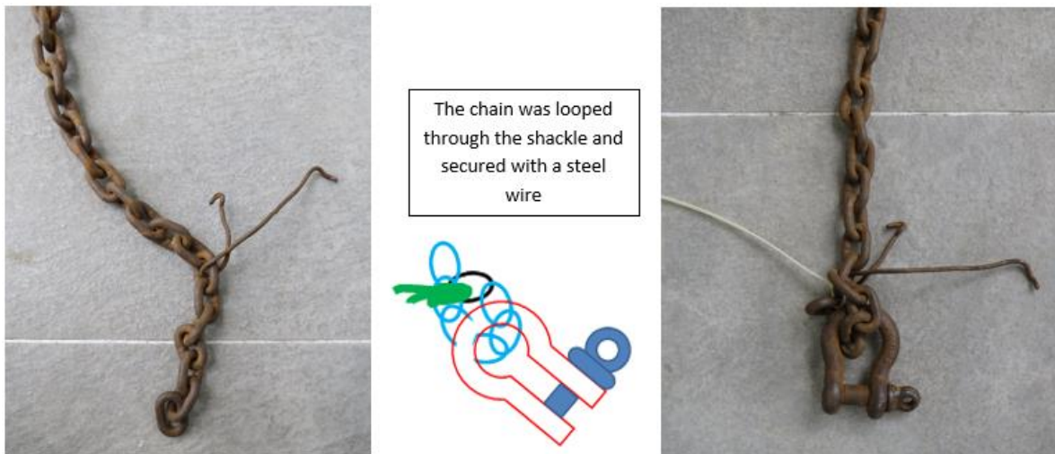
Images 6 and 7: Steel Wire and Shackle Attached to One Leg of the Two-Legged Chain