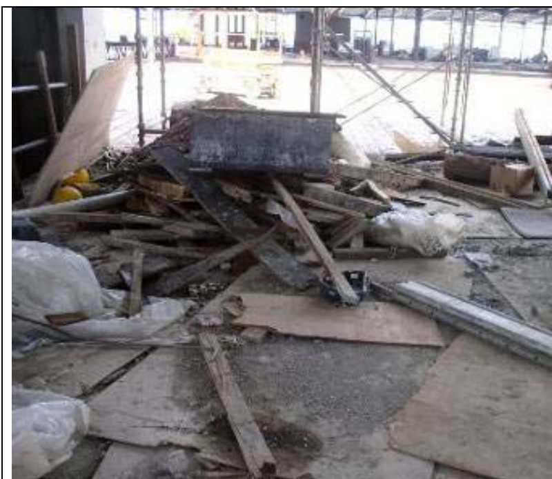
Poor housekeeping resulting in tripping hazards