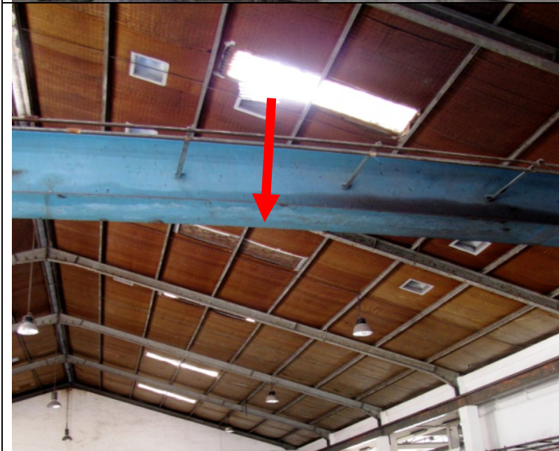
Lack of control measures for work on fragile roof surface (e.g. roof skylight of existing factory premises)