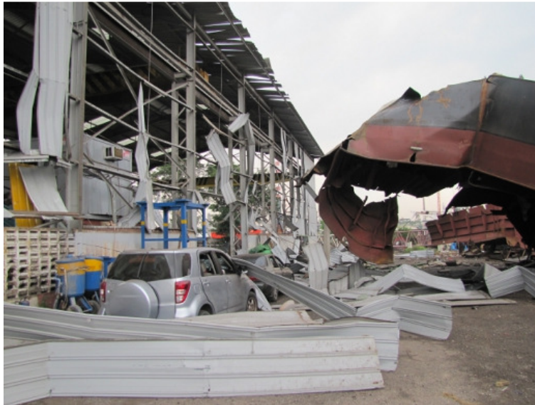
Photograph 5: The wall panels of the workshop beside the barge were dislodged by the blast