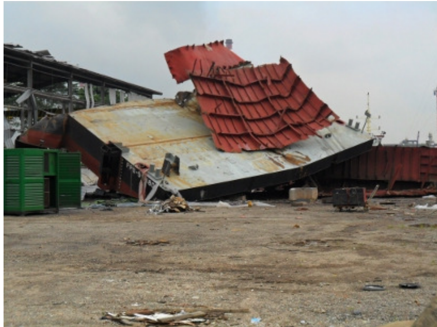
Photograph 3: The front part of the damaged barge