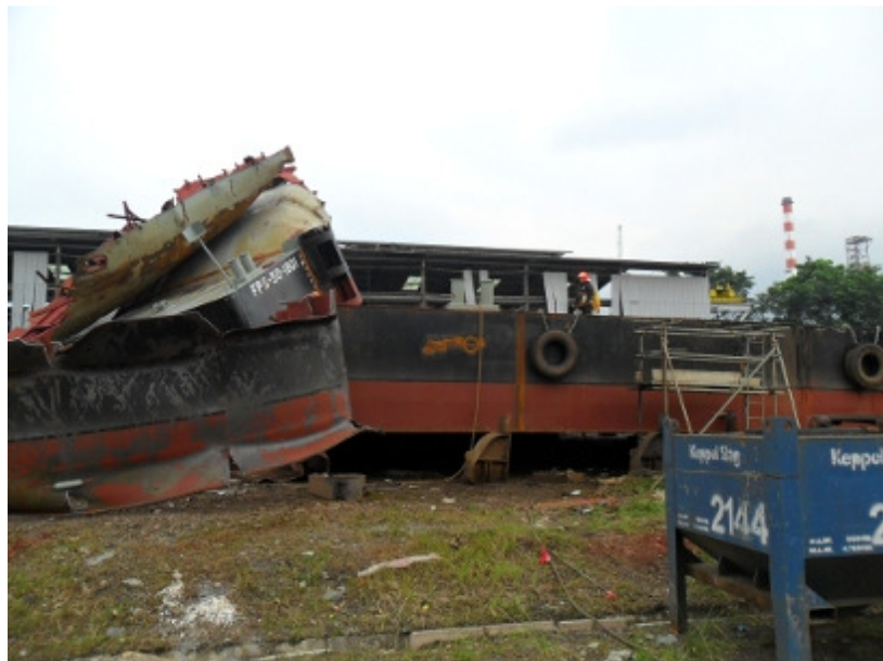
Photograph 2: The Port side of the barge, with its front part damaged by the blast