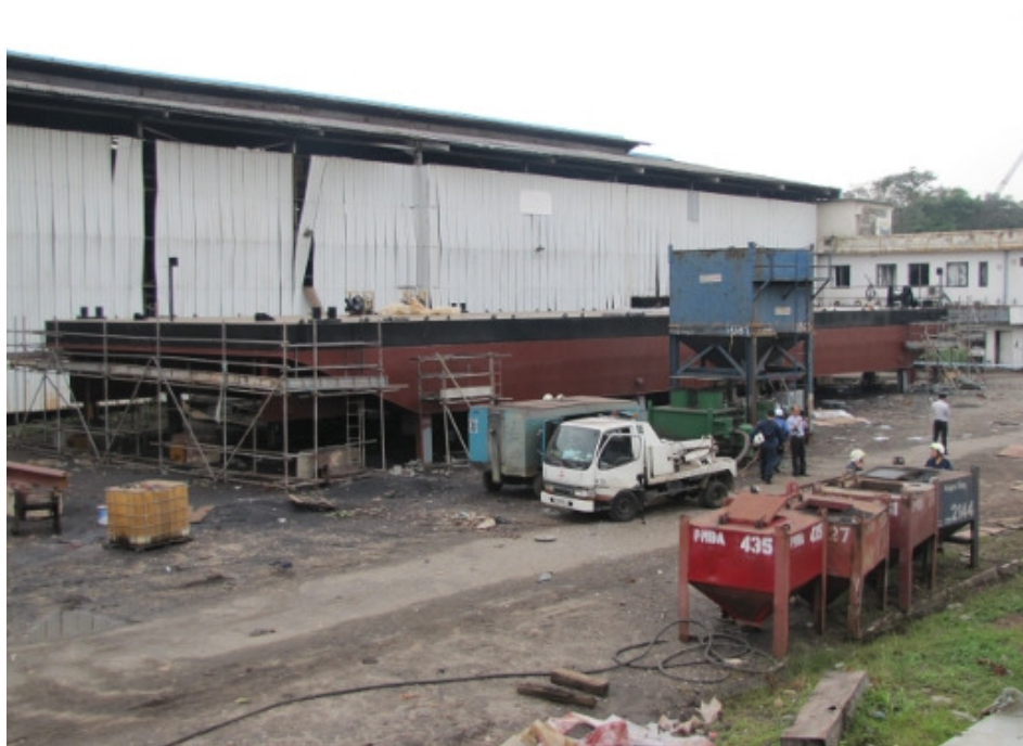
Photograph 1: An undamaged barge, similar to the one in the accident