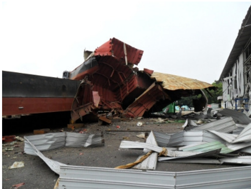
Photograph 4: The view of the damaged barge from its Starboard side. The workshop is on the right side of the photograph.