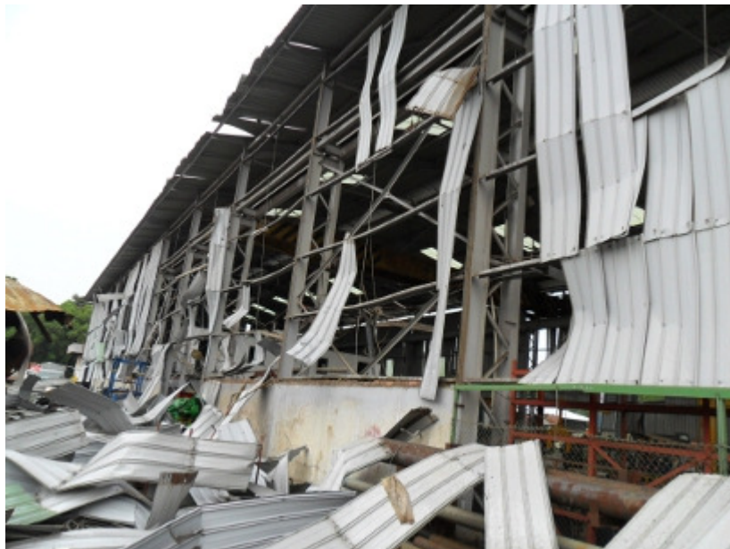
Photograph 6: Another view of the workshop