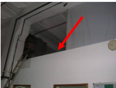
Improper access to mezzanine floor and open sides