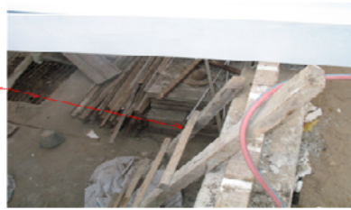
Unsecured wooden ladder