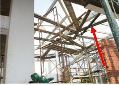
Unsecured work platforms