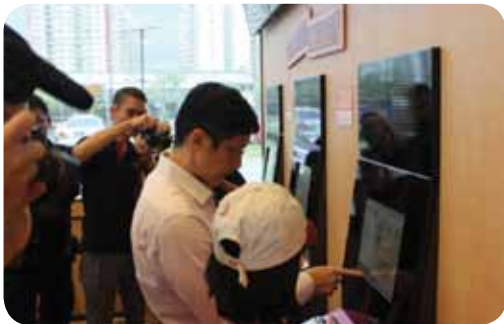
MOS Teo using the self-service kiosk