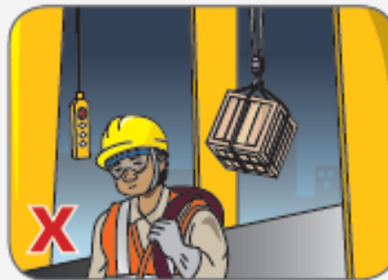
Figure 6: Safety considerations when operating cranes and hoists.

Do not leave suspended load overnight or unattended.