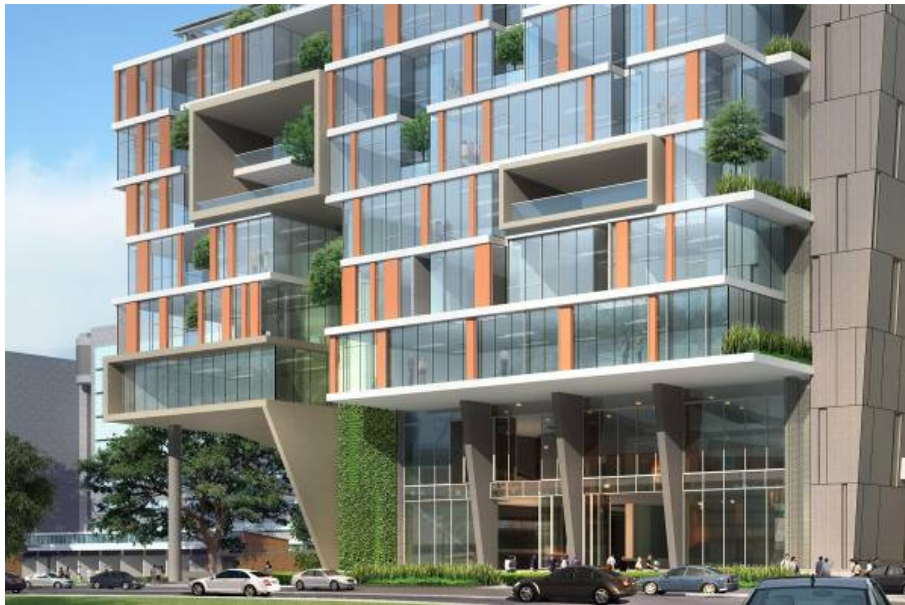
View from Certis Cisco Building, along Eunos Avenue 5