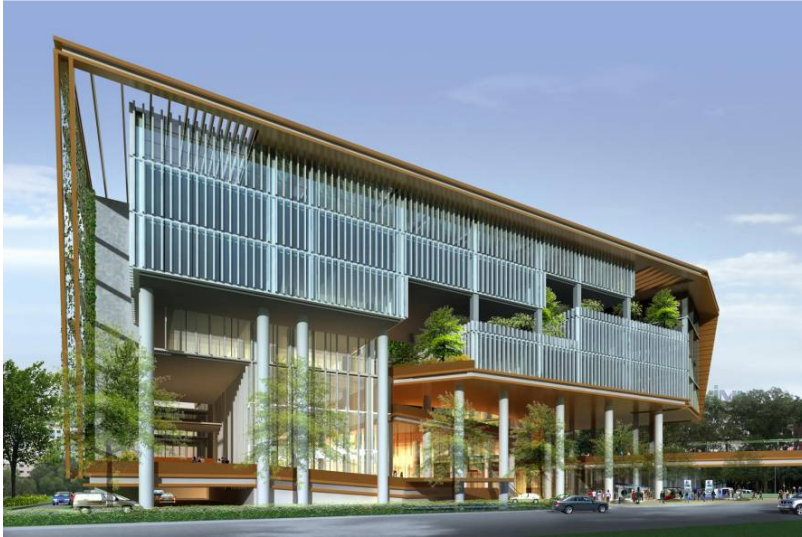
View of Jurong East Street 21