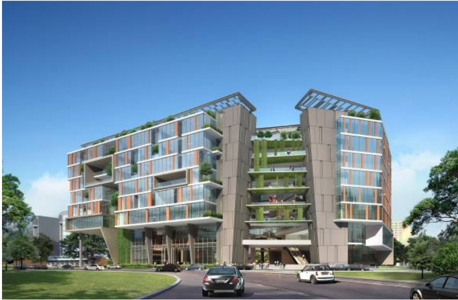
View from Paya Lebar Road