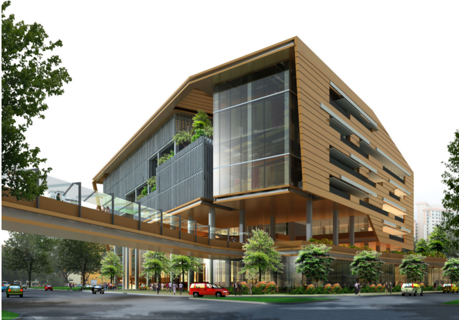
View from Junction of Jurong East Street 21 and Jurong Gateway Road