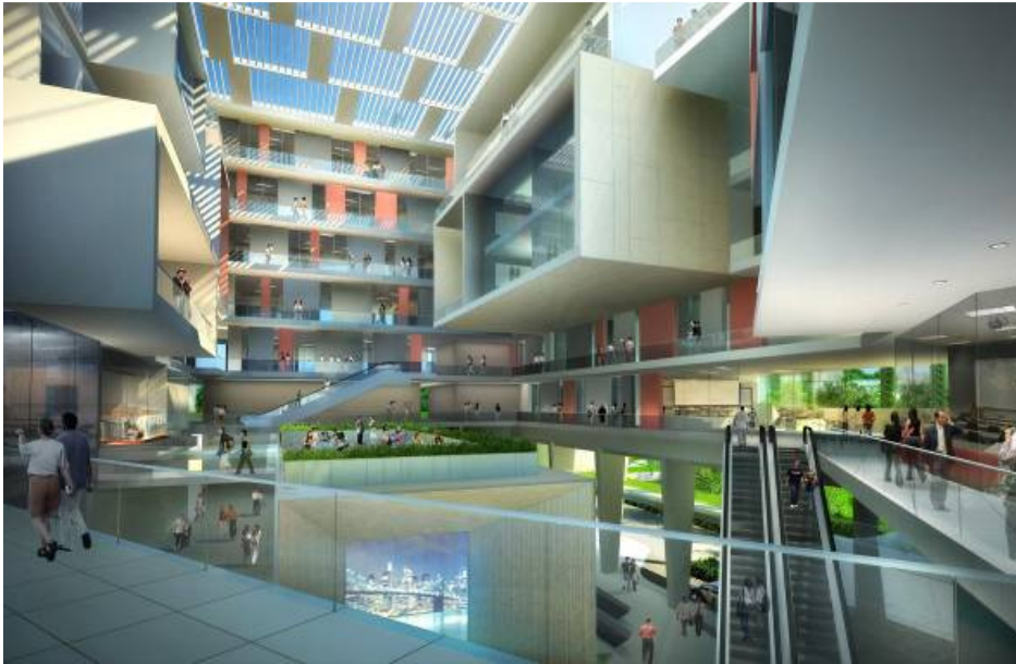
View of Campus Atrium from Campus 3 rd Storey