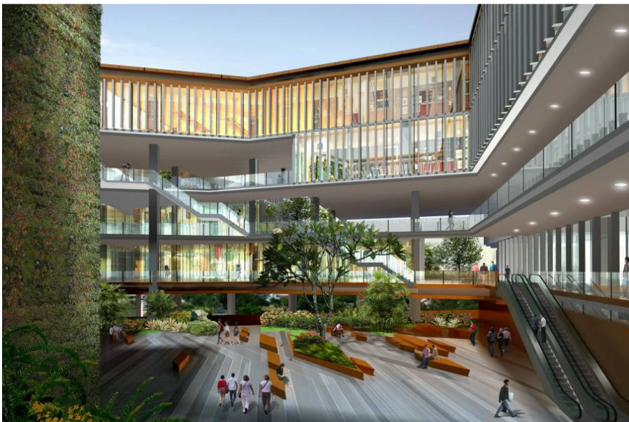
View of Open Courtyard from Campus 3 d storey