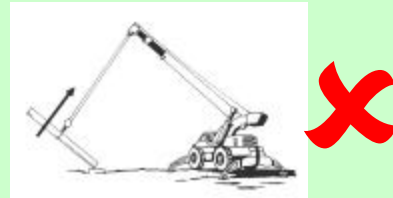
Dragging is expressly forbidden

The crane operator had lowered his hook block from an opening into the basement infrastructure. The workers at the basement then pulled the hook block away from the opening and rigged up a truss structure. They then gave the signal to the operator to lift. The boom of the crane snapped when the load was dragged out.