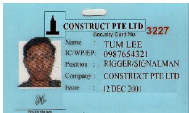
SAMPLE IDENTIFICATION TAG

The identification tag shall indicate the wearer's name and identification card / work permit number, appointment (rigger / signalman), and his employer.