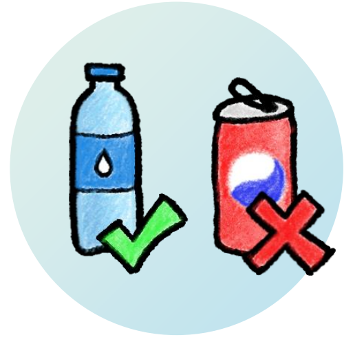
Drink water instead of sugary beverages.