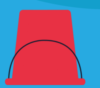
Remove all stagnant water by turning over containers, pots and pails